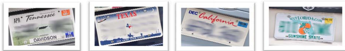
Photos of Visitors'/Participants' Vehicle Tags From 2009 Festival

Attendance for the three-day 2009 Festival of Discovery has been estimated at 20,000. Information collected from Festival attendees reflects the most concentrated area of origin for attendance was from Greenwood County (55%) while attendance from outside Greenwood County (including states neighboring South Carolina) accounted for the remaining 45%. 2009 Festival data shows participants and attendees of the event represented 164 zip codes and 14 states (including Texas, New Jersey, Colorado and California). We will continue in our efforts to increase advertising in neighboring counties and states in 2010.